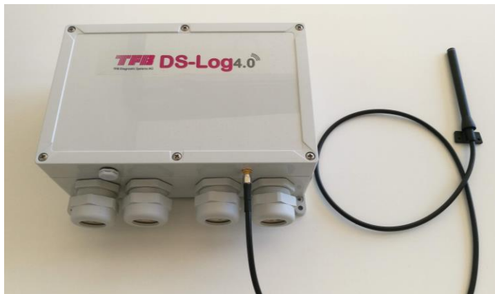
Fig. 3: DS-Log4.0

The device also has a Bluetooth LE interface for local wireless data readout and configuration. It can operate at temperatures between -20 and 50 °C and the enclosure is watertight (IP67). The lithium battery typically lasts for 3 to 5 years, depending on the logging interval.